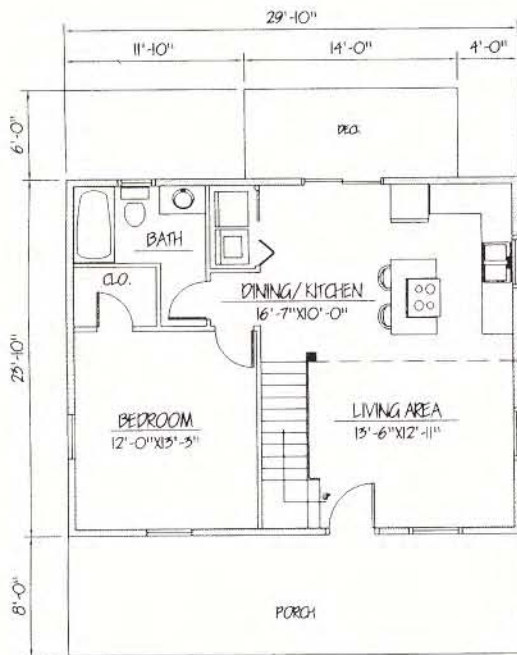
FIRST FLOOR PLAN 720 © 1999 Honest Abe Log Homes SQ. FT.